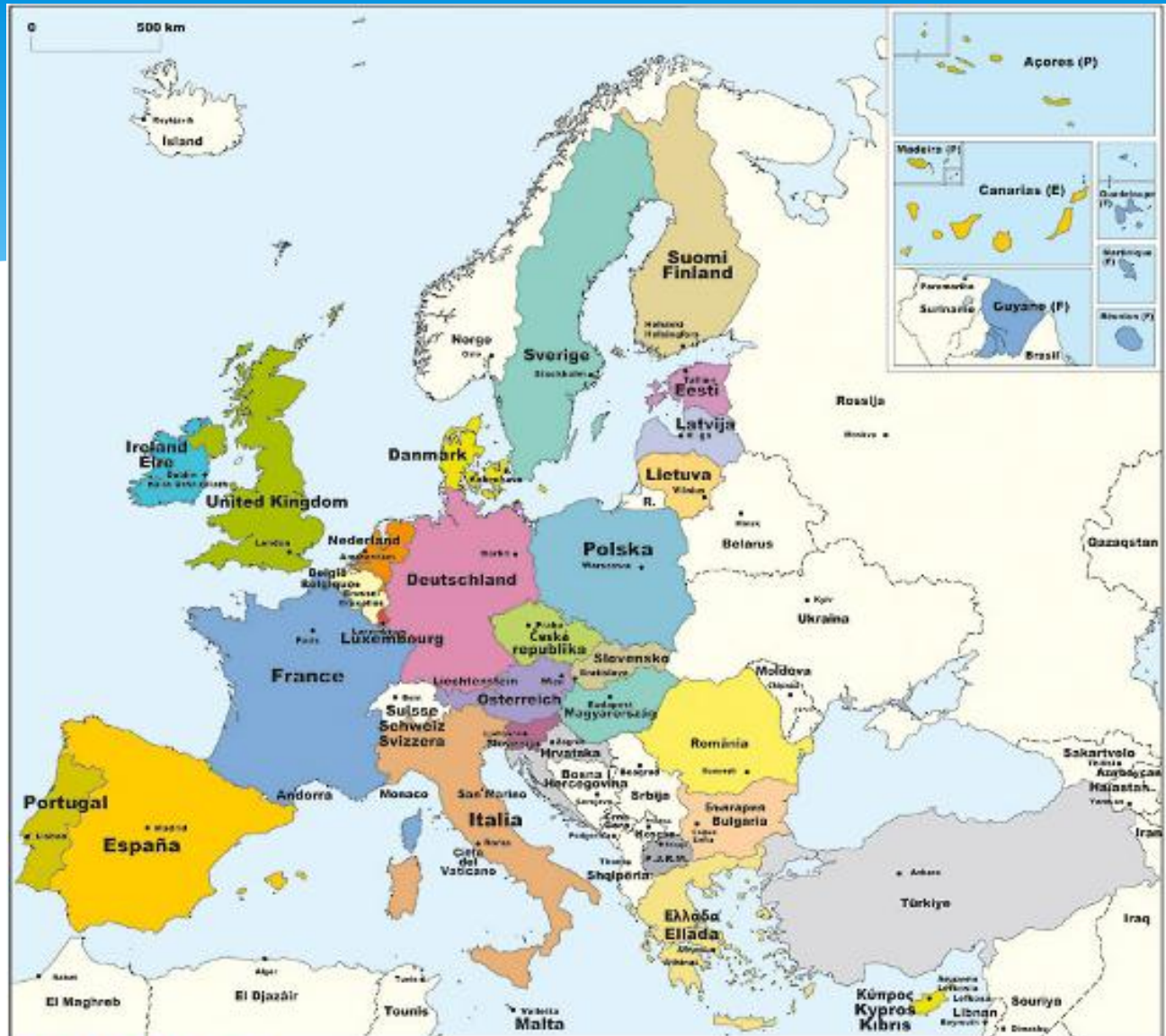
Member states of the European Union (2008) Candidate countries